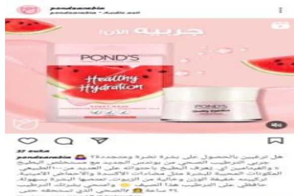
Figure 4. Factual Presupposition

The factual presupposition is a presumption or assumption following a verb that is considered a fact. Usually, factual presuppositions are triggered by the use of certain words or phrases that imply that an action or situation actually occurs or exists, without requiring further proof. In advertising, this type of presupposition is used to give the impression that a result or benefit of the product has been proven, thus making consumers more trusting (Mono et al., 2019). This study found 4 (7%) active presuppositions, one of which is elaborated on below.