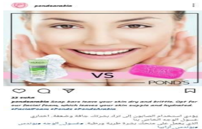
Figure 3. Lexical Presupposition

Lexical presuppositions are speakers' initial assumptions where conventionally stated meanings are interpreted with presuppositions of other understood meanings. This means that the presupposition is stated implicitly. In the context of advertising, lexical presuppositions are often used to build a positive narrative about the product and encourage consumers to believe in the benefits of the product (Amri et al., 2023; Melly & Ambalegin, 2022). This study found lexical presupposition in 20 (36%) advertisements. One of them can be seen in the following data.