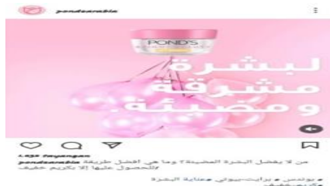
Figure 5. Structural Presupposition

Structural presupposition is a presumption that certain sentence structures have been analyzed as assumptions that remain and are conventionally assumed to be true (Yule, 1996). The structural presupposition included 12 (4%) advertisements. One of them is discussed below.